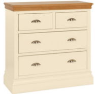
LC60 2 + 2 Chest H 945 x W 920 x D 420 mm