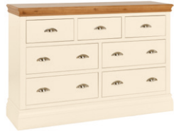
LC90 3 Over 4 Chest H 945 x W 1330 x D 420 mm