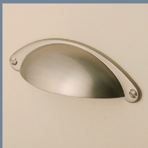
Cup Handles on Drawers