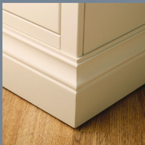
Painted sculptured plinth