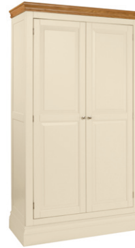
LW20 Double Wardrobe H 1920 x W 1035 x D 540 mm Supplied with one double hanging rail