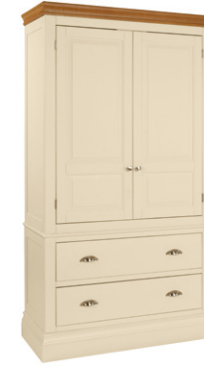
LW55 2 Drawer Double Wardrobe H 1942 x W 1035 x D 540 mm Supplied with one double hanging rail