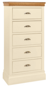
LB50 5 Drawer Wellington H 1320 x W 610 x D 420 mm