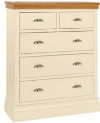
LC70 3 + 2 Chest H 1180 x W 920 x D 420 mm