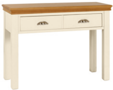
LD30 Dressing Table H 795 x W 1023 x D 414 mm