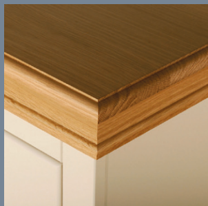
Oak sculptured top

Enhance your living space with our Lundy Collection. You can create a warm and comfortable feel to your home, knowing each piece is individually crafted. We employ the best techniques whilst incorporating valued features such as high quality construction throughout, dovetailed drawers, sculptured oak tops, contemporary handles and a long-lasting ivory paint finish.