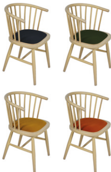
BER108D / BER108G / BER108M / BER108R Wooden Carver Dining Chair H 790 x W 540 x D 480 mm With Dark Grey, Green, Mustard and Rust Seat Pad