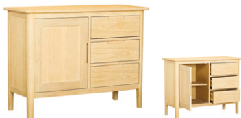
BER051 1 Door 3 Drawer Sideboard H 780 x W 1025 x D 440 mm