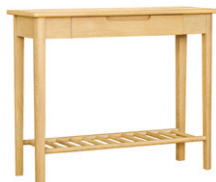
BER079 Console Table with Drawer H 800 x W 1000 x D 350 mm