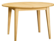
BER130 Round Fixed Top Dining Table H 770 x W 1200 x L 1200 mm Comfortable seats 4.