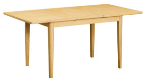
BER093 Small Extending Dining Table H 760 x W 900 x L 1250 - 1650 mm With 1 extension leaf. Comfortable seats 4-6