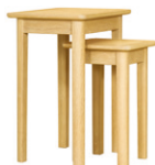
BER076 Nest of 2 Tables H 600 x W 450 x D 350 mm