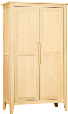
BER031 Double Wardrobe with Shelving H 1900 x W 1100 x D 550 mm