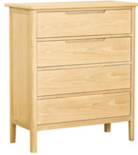
BER012 4 Drawer Chest H 1010 x W 900 x D 440 mm