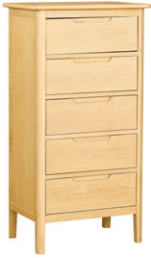
BER002 5 Drawer Wellington H 1200 x W 630 x D 440 mm