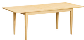
BER094 Medium Extending Dining Table H 760 x W 900 x L 1600 - 2000 mm With 1 extension leaf. Comfortable seats 6-8.