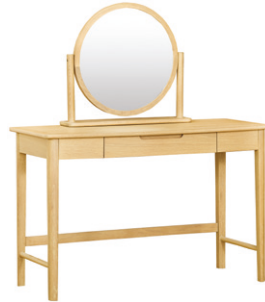
BER023 Mirror H 600 x W 675 x D 150 mm