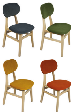
BER107D / BER107G / BER107M / BER107R Fabric Dining Chair H 880 x W 480 x D 490 mm In Dark Grey, Green, Mustard and Rust