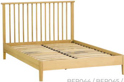
BER044 / BER045 / BER046 4'6" / 5' / 6' Low Foot End Spindle Bed H 1070 x W 1470 / 1620 / 1920 x L 1970 / 2170 / 2170 mm