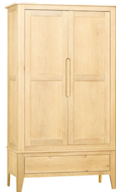
BER032 Double Wardrobe with 1 Drawer H 1900 x W 1100 x D 550 mm