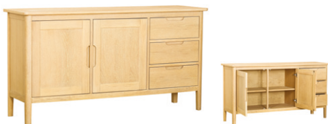
BER052 2 Door 3 Drawer Sideboard H 780 x W 1500 x D 440 mm