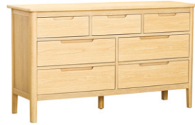
BER006 3 Over 4 Chest H 790 x W 1350 x D 430 mm